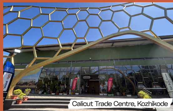
Calicut Trade Centre, Kozhikode

Strategically located, the city attracts visitors from across Kerala as well as nearby Tamil Nadu and Karnataka, within a 200 km radius — making it the ideal hub for a large-scale industry-specific expo.