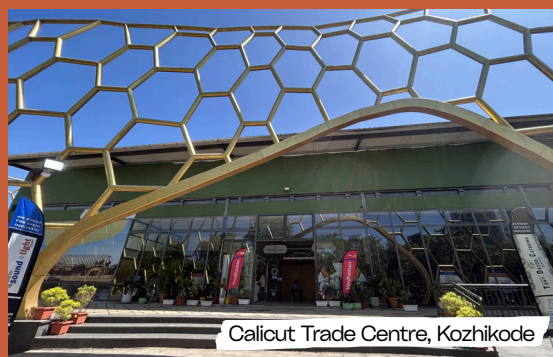
Calicut Trade Centre, Kozhikode

Strategically located, the city attracts visitors from across Kerala as well as nearby Tamil Nadu and Karnataka, within a 200 km radius — making it the ideal hub for a large-scale industry-specific expo.